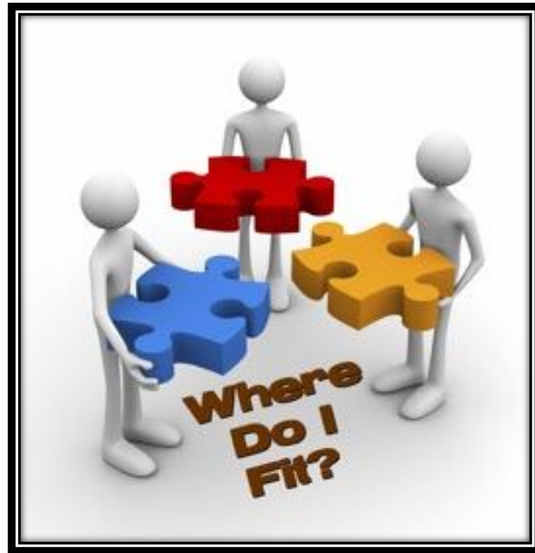
A Report from the Ministries Team